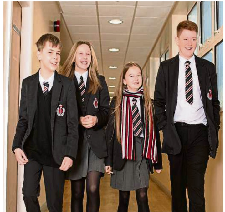
STEPPING INTO THE FUTURE: Pupils at the recently Transformed Integrated College Glengormley

This is a hugely significant opportunity that must see full implementation. Further positive legislative changes means that the exemption of teachers from the Fair Employment Treatment Order will soon become a thing of the past. The Fair Employment (School