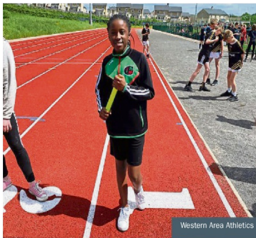
Western Area Athletics