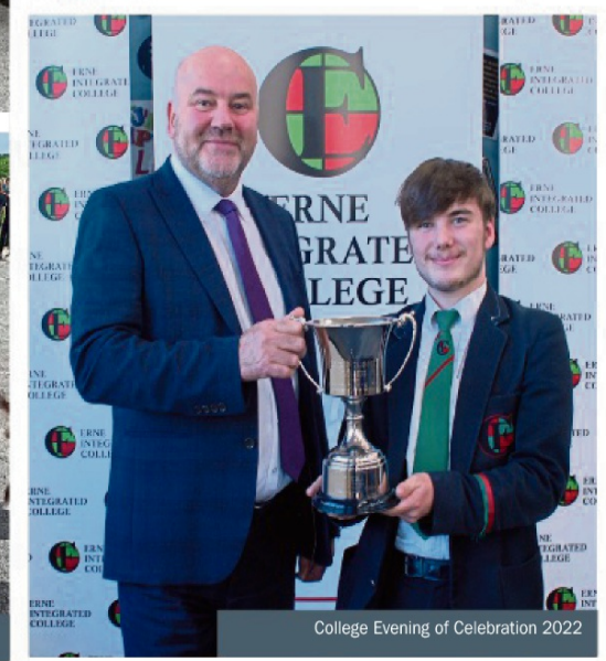
College Evening of Celebration 2022