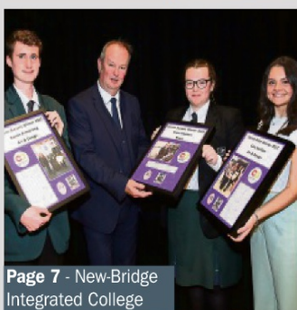
Page 7 - New-Bridge Integrated College