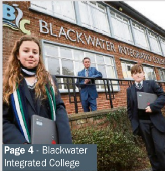
Page 4 - Blackwater Integrated College