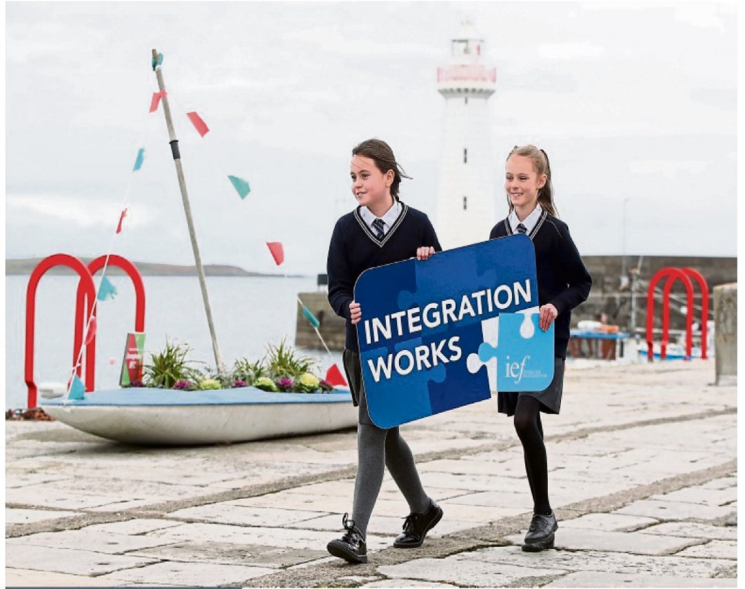
EMBRACING CHANGE: Pupils at St Anne's PS Donaghadee

“None of this success could have been achieved without the help of our supporters here and indeed worldwide