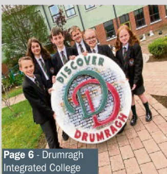
Page 6 - Drumragh Integrated College