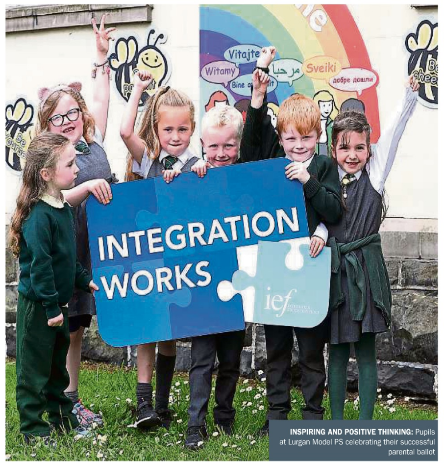
INSPIRING AND POSITIVE THINKING: Pupils at Lurgan Model PS celebrating their successful parental ballot