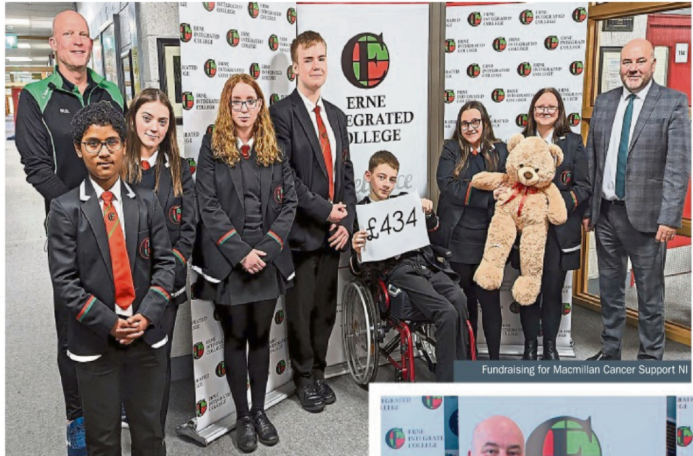
Fundraising for Macmillan Cancer Support NI

We are proud to be a school where community is at the centre of everything that we do, where difference is embraced, explored and celebrated and where there is excellence for everyone. For more information contact the college at 028 6632 5996, check Facebook or go online at www.erneic.org.uk