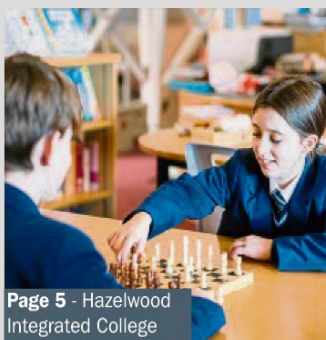
Page 5 - Hazelwood Integrated College