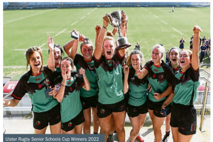
Ulster Rugby Senior Schools Cup Winners 2022