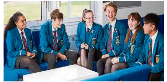
Sixth Form students enjoying life at Slemish College

Slemish College is a vibrant, forward thinking learning community with a wonderfully diverse family of learners.